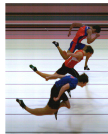
PHOTO FINISH OPTIc3-PRO